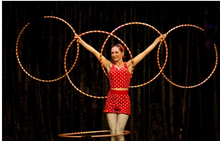
Plate spinning, a stilt-walking circus ringmaster, Punch and Judy shows, and a drumming band will come together to hit all the right notes in Rhyl.

The high street will have a circus-themed makeover for the latest free offering from Rhyl Town Council.